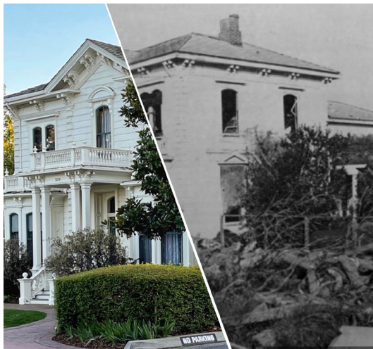
This year, the Rengstorff House - one of the finest examples of Victorian Italianate architecture - celebrates 30 years since its restoration and opening to the public. Learn more about the oldest remaining historic home in Mountain View by visiting MountainView.gov/RengstorffHouse .

For more information on these academies and other programs from the Multicultural Engagement Program, visit MountainView.gov/MEP .