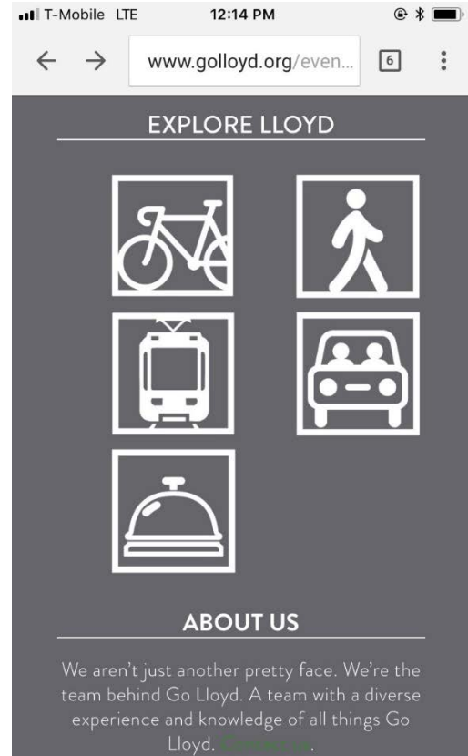
Figure 8 Go Lloyd Website

The developer can work with the City to designate commercial loading zones internal to the residential site. Loading zones facilitate drop-offs and pick-ups (e.g. carpool and rideshare) and enable efficient deliveries of goods and services. Loading zones must be located near building entrances, elevators, and/or at corners with curb ramps. Strategic location of these delivery zones may reduce the number of vehicle trips circling to serve multiple destinations near one another.