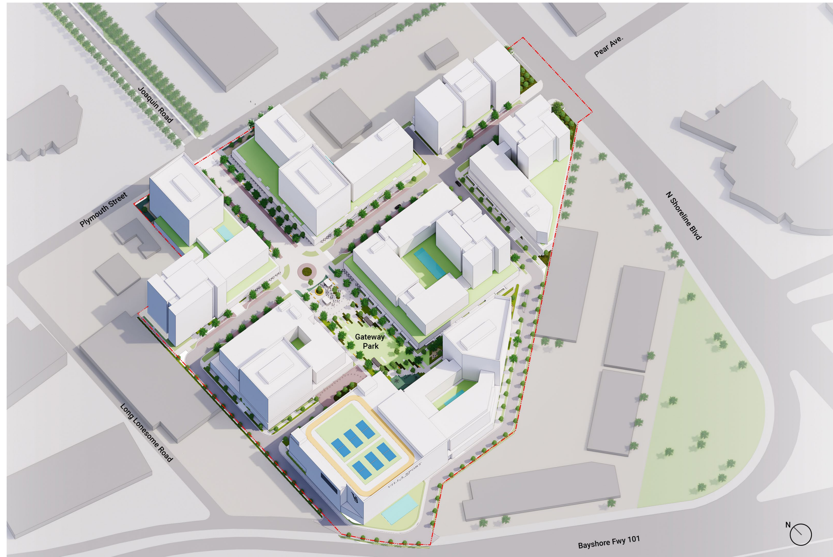
Aerial Massing from Southwest (with Existing Context)