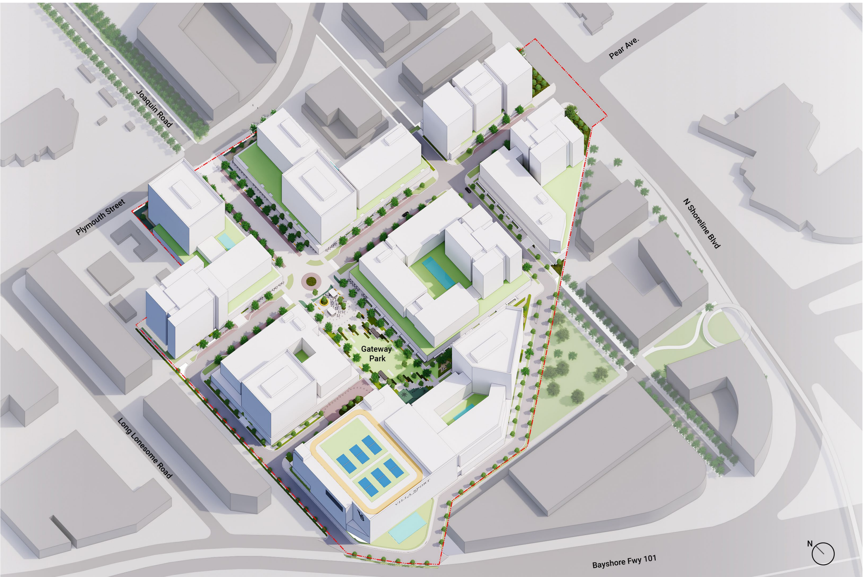
Aerial Massing from Southwest (with Planned Context)