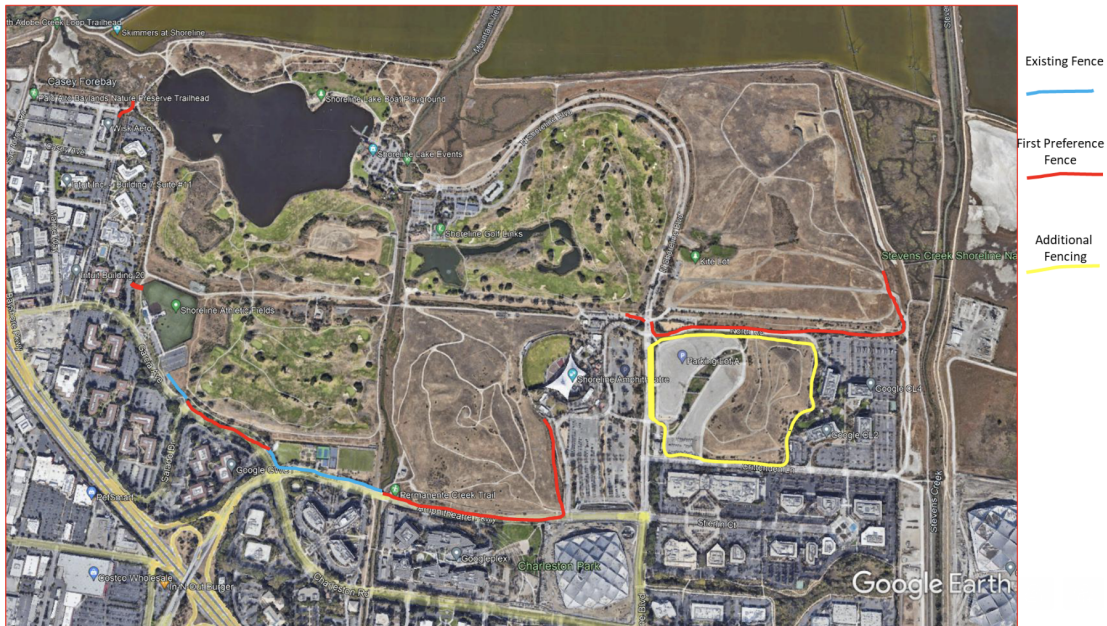
Figure 1: recommended fencing for Shoreline park (existing fencing in blue, first priority for additional fencing in red, second priority for additional fencing in yellow)